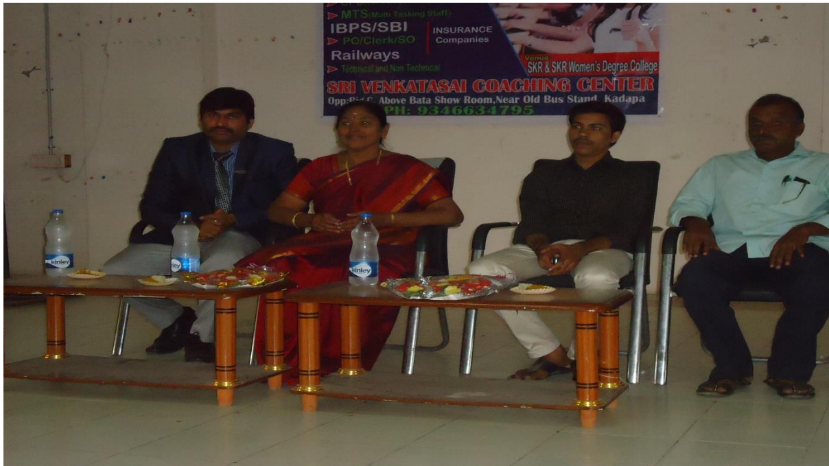
Representatives of Sri Venkata Sai Coaching Centre explained on employment opportunities in various public and private sectors