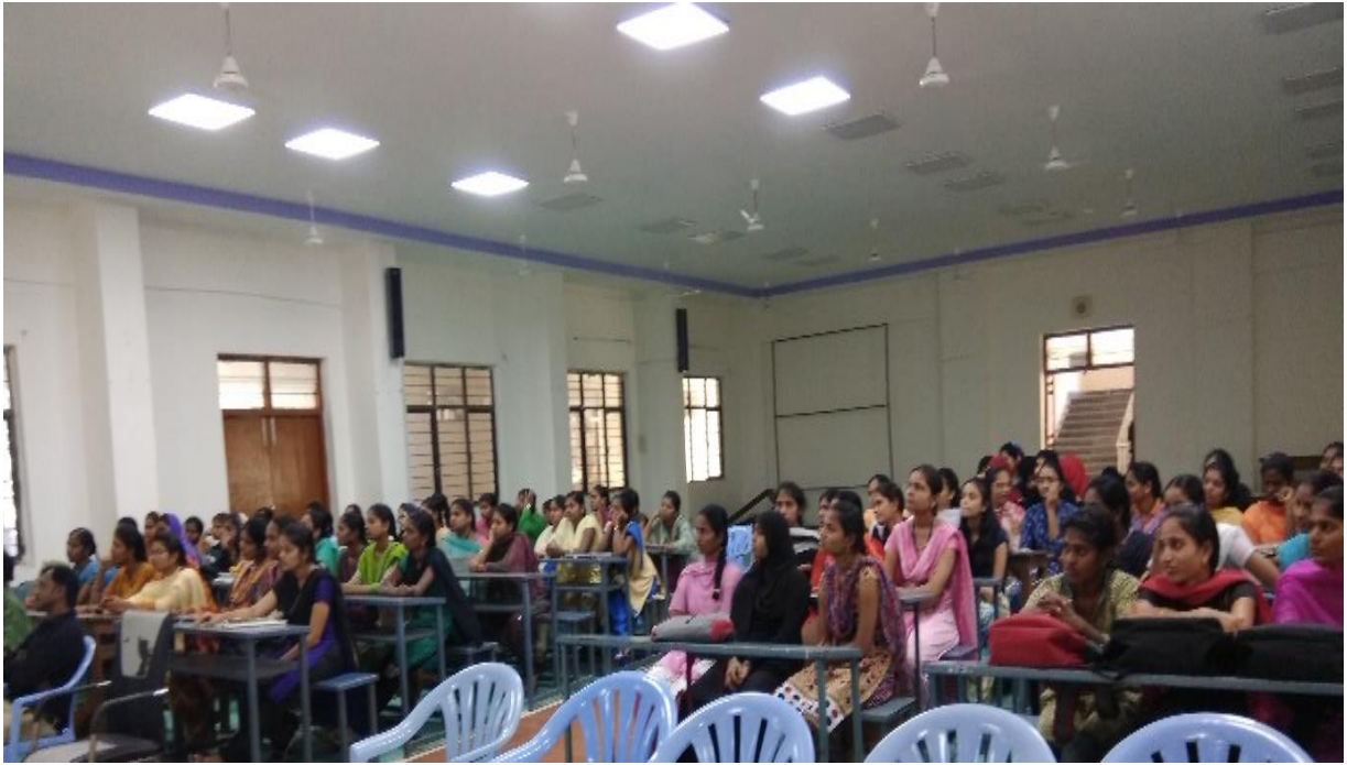
Students participation in Employment Skills programme