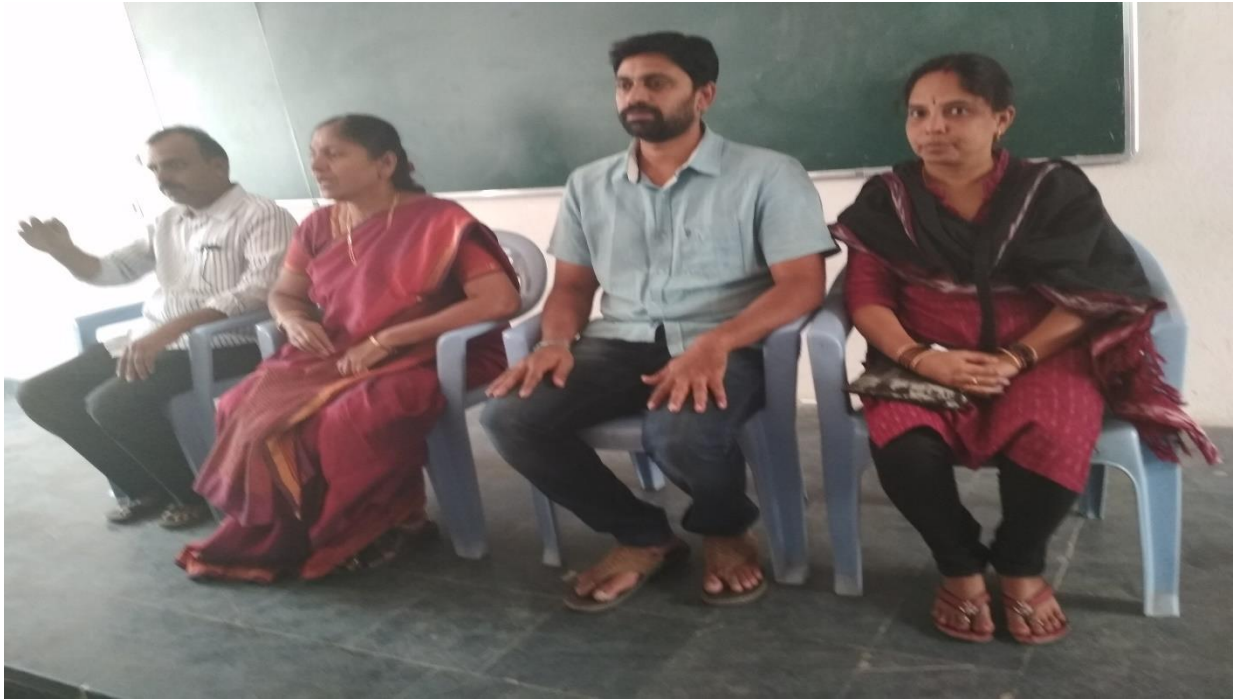
Sai Balaji Coaching Centre on Employment Opportunities