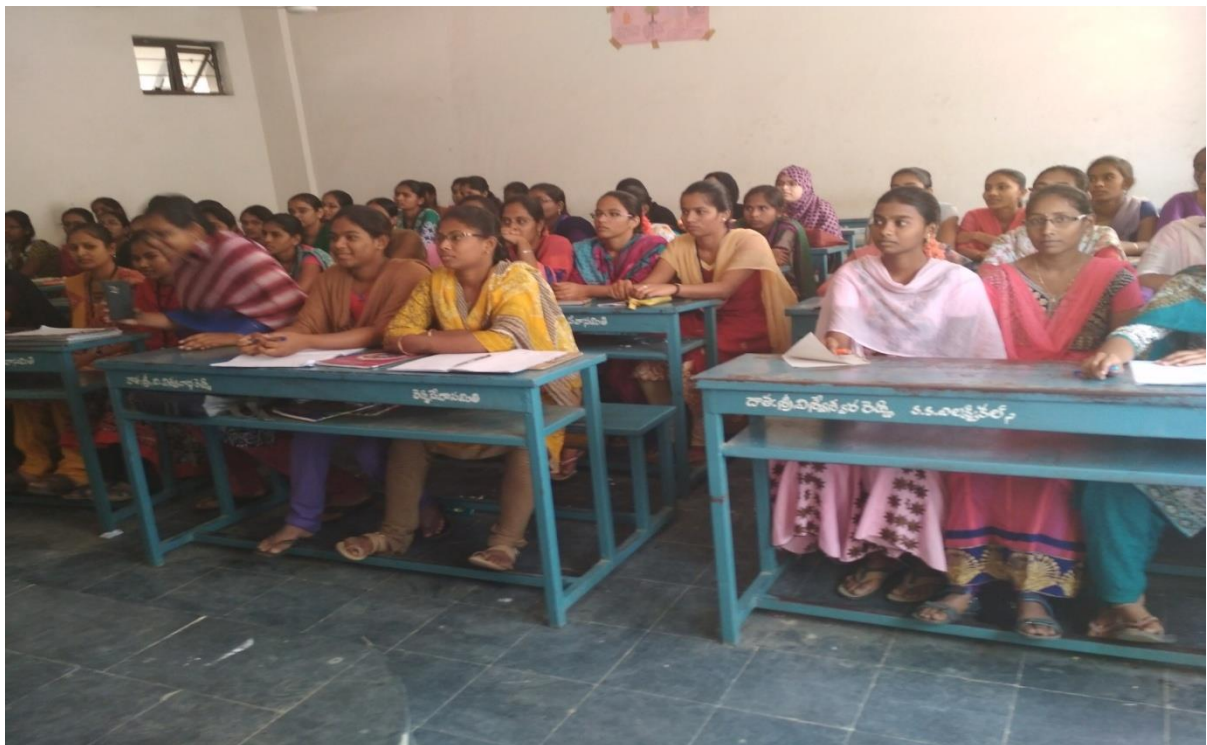
Final Year Students of SKR & SKR Govt. College (A), Kadapa are listening about the Employability Skills on Group II coaching